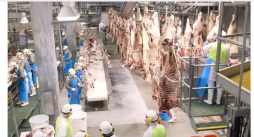
MODULE 5 ROLES AND RESPONSIBILITIES IN AN EMERGENCY ANIMAL DISEASE EVENT